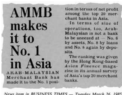
News item in BUSINESS TIMES — Tuesday March 26, 1985