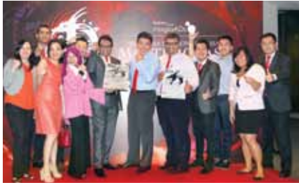
Winning the "Best Social Media or Word of Mouth Campaign" at the 2014 PMAA Dragons of Malaysia.