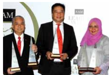
AmlInvestment Bank Berhad bagging five awards at the 12th RAM League Awards 2014.