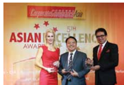
AmBank Group was awarded with the Asia's Best Chief Financial Officer, Best Investor Relations Company in Malaysia and Best Corporate Social Responsibility in Malaysia Awards at the Fifth Asian Excellence Recognition Awards 2015.